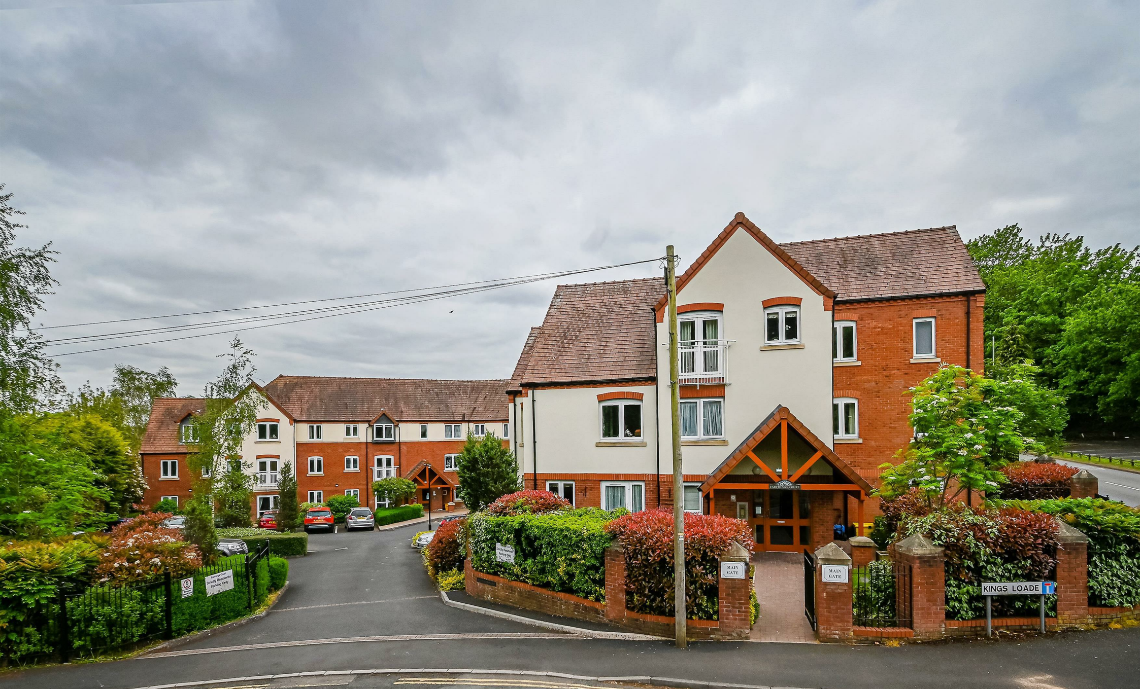
24 Farthings Court Kings Loade, Bridgnorth, Shropshire, WV16 4DA